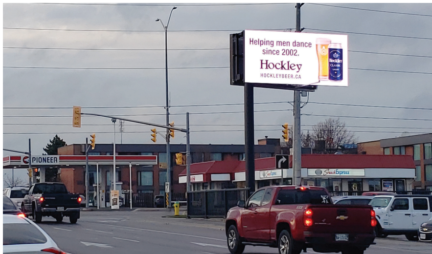
Location # DB001 Facing North Visual impressions per day = 37,000 (factored vehicles & occupants)

DB001 & DB002 are 10'x20 Digital Posters located at the southeast corner on North Front & Bell Boulevard in Belleville Ontario. This is Bellevilles busiest corner and en route to the Quinte Mall, Shorelines Casino, Canadian Tire and many more major shopping, banking and restaurant locations.