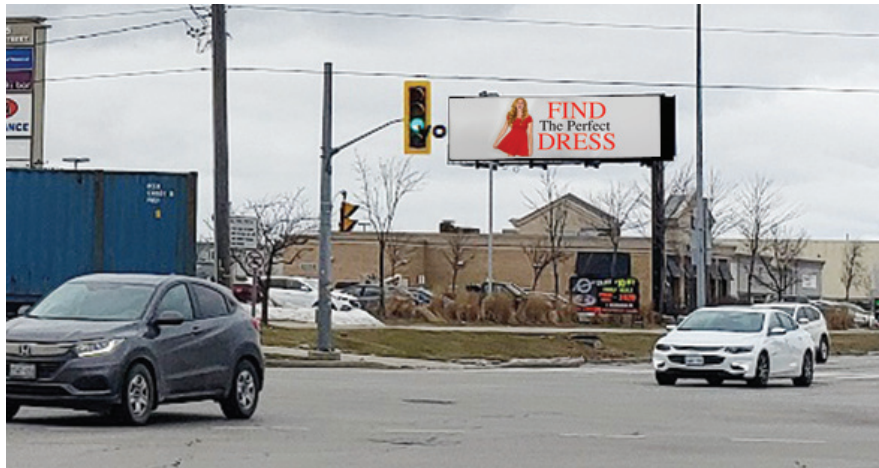
Location #DB003 Facing North COMMB Average Daily Circulation 25,500 (factored vehicles & occupants)