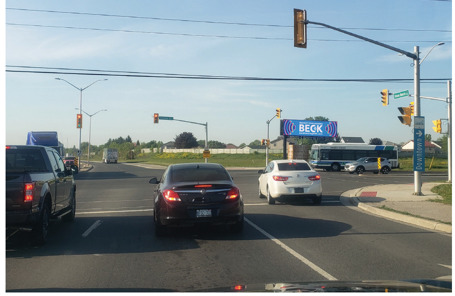
Location DL005 Facing North

This 10'x35' Digital billboard is located at 2235 Dundas Rd & Veterans Parkway. This is the closest billboard enroute to London International Airport and the North Face is visible to vehicles turning right onto Dundas to head into London's downtown core.