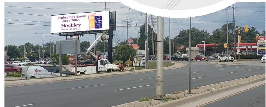
Location # DL002 Facing South Visual impressions per day = 28,300 (factored vehicles & occupants)

Over 2 million visual impressions per month (factored vehicles and occupants)