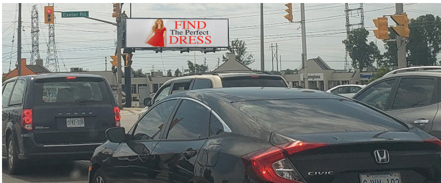
Location # DL001 Facing North Visual impressions per day = 44,600 (factored vehicles & occupants)